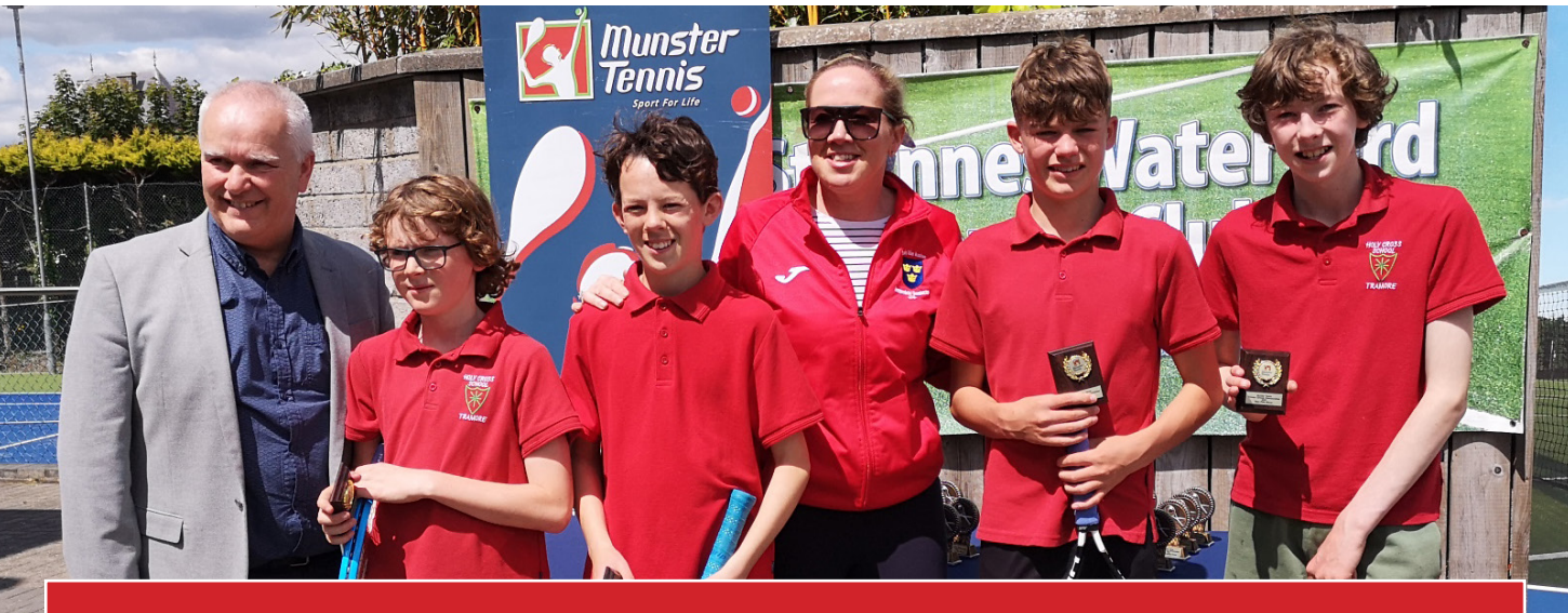
Boys Cup Winners - Holy Cross, Tramore, Co. Waterford

Girls Under14 Cup – Scoil Mhuire, Cork Boys Under14 Cup – Presentation, Cork Girls Under16 Cup – St Angelas Waterford Boys Under16 Cup – Christians, Cork Girls Under19 Cup – St Angelas, Cork Boys Under19 Cup – Presentation, Cork Girls Under 14 Shield – St Angelas, Cork Boys Under 14 Shield – St Francis College, Cork Girls Under 16 Shield – St Marys, Nenagh Boys Under 16 Shield – Glanmire Community College, Cork Girls Under 19 Shield – St Mary's, Nenagh