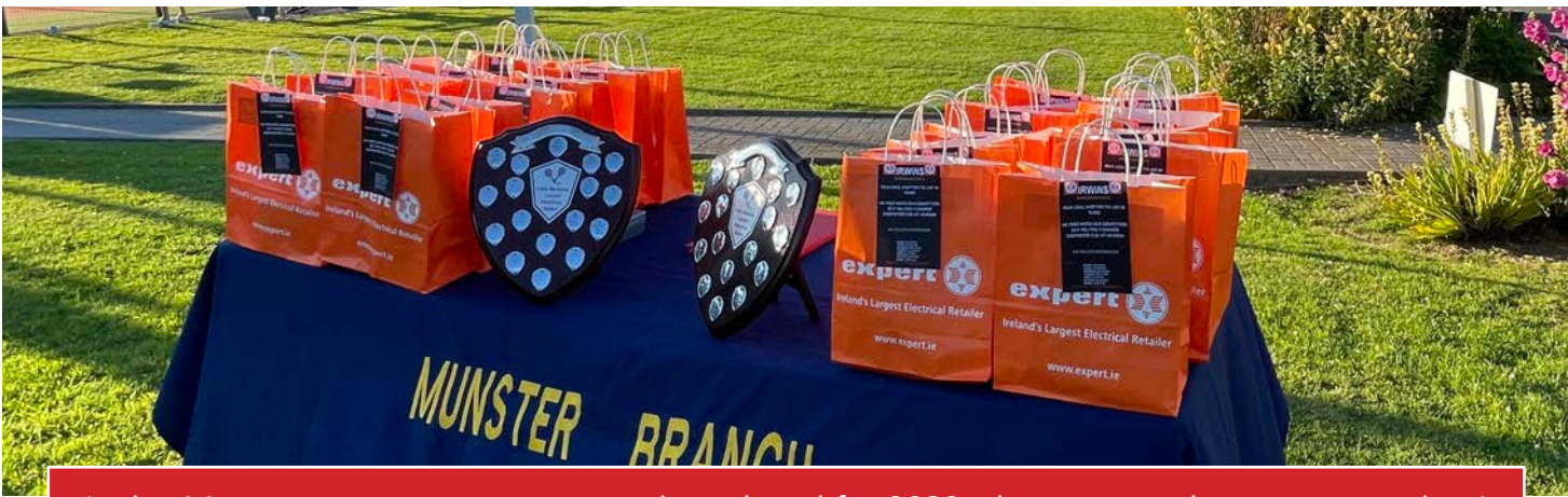
Irwins Megastore were a new partner introduced for 2022 who presented some great prizes!

Munster Tennis have continued to make use of the Tennis Courts at the Resort and several new initiatives will be launched in Summer 2023 in