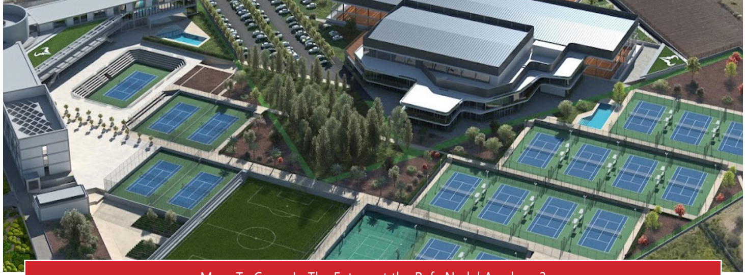
More To Come In The Future at the Rafa Nadal Academy?