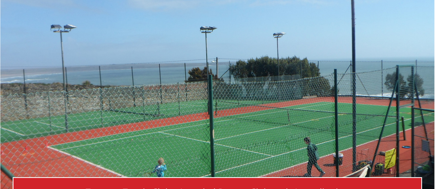
Tramore Tennis Club : Awarded Bronze Clubmark Accreditation

For now, I want to give all clubs a quick reminder that they must have a Safeguarding Statement (template available in appendix 2 of the Tennis Ireland Safeguarding manual) – this is a legal requirement, so is the first thing that a club should have in place. This needs to be reviewed