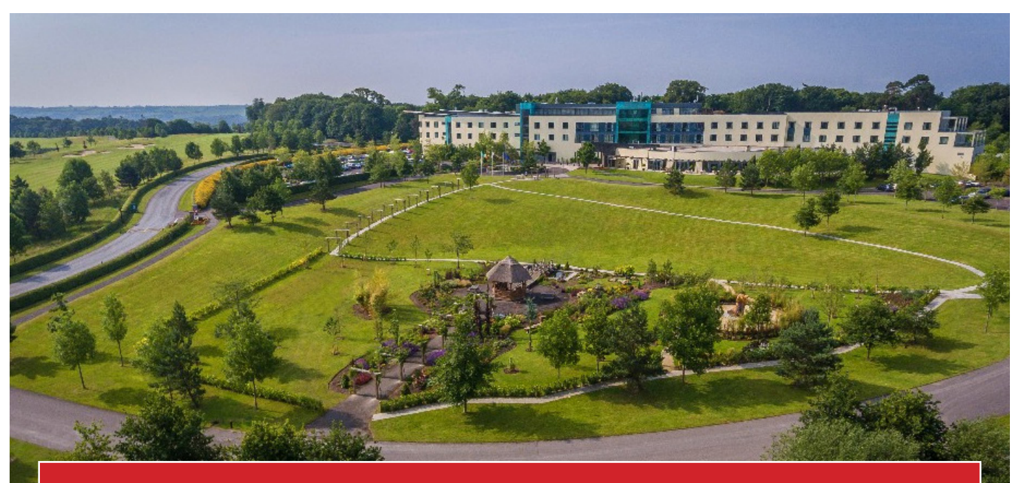
Fota Island Resort continue to be superb partners with us running events at The Tennis Hub.

What has been the result of all these efforts both last year and in previous years? With the latest increases in 2022/2023 this means that the Munster Tennis Winter League continues to be the largest Tennis League in Ireland and also the largest Tennis League in Europe!