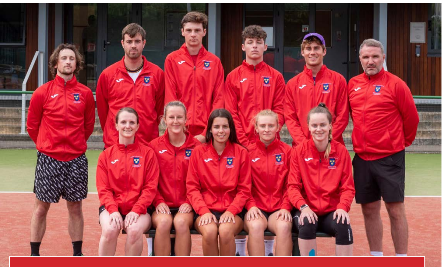
Senior Interprovincial Team at Sunday's Well Boating & Tennis Club