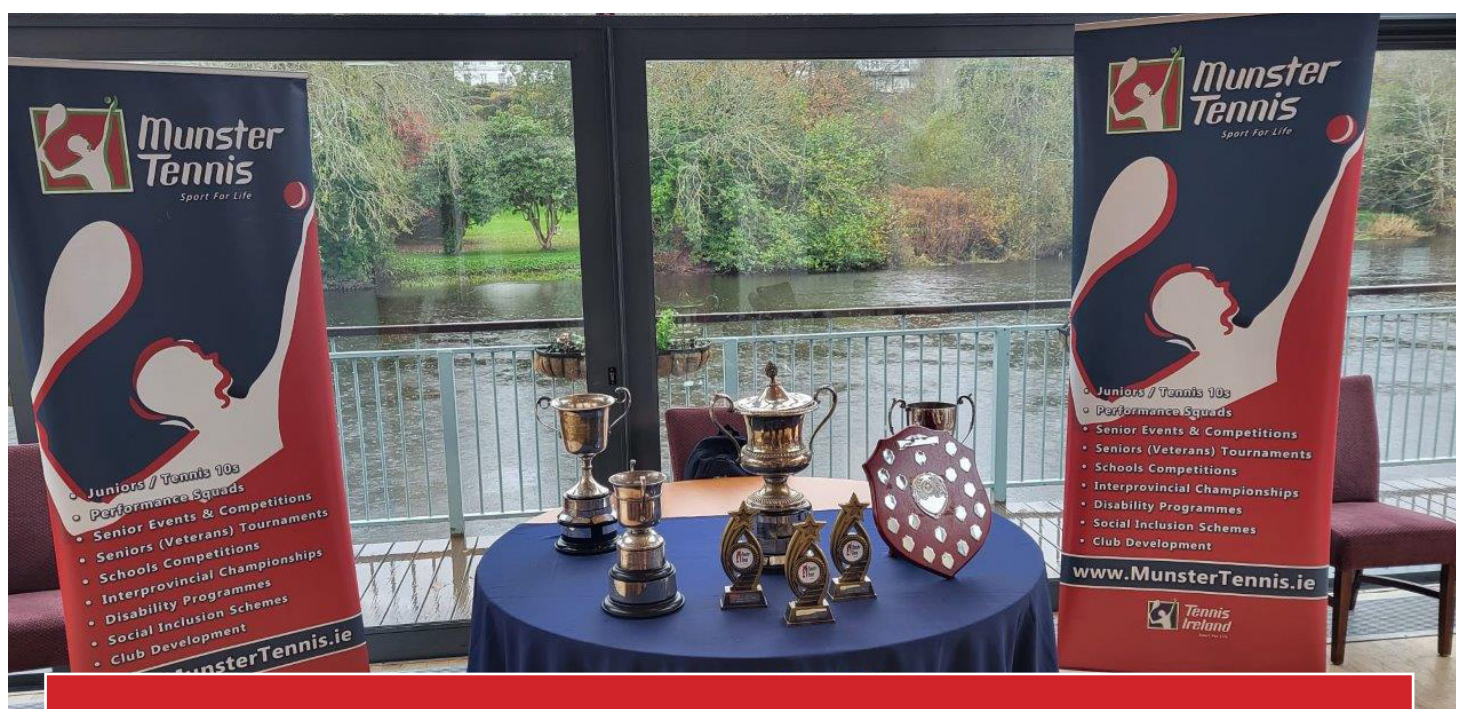
Junior Cups Finals Day - Hosted At Sunday's Boating & Tennis Club

Review criteria for running events on regular basis. Review criteria for Munster Team selection