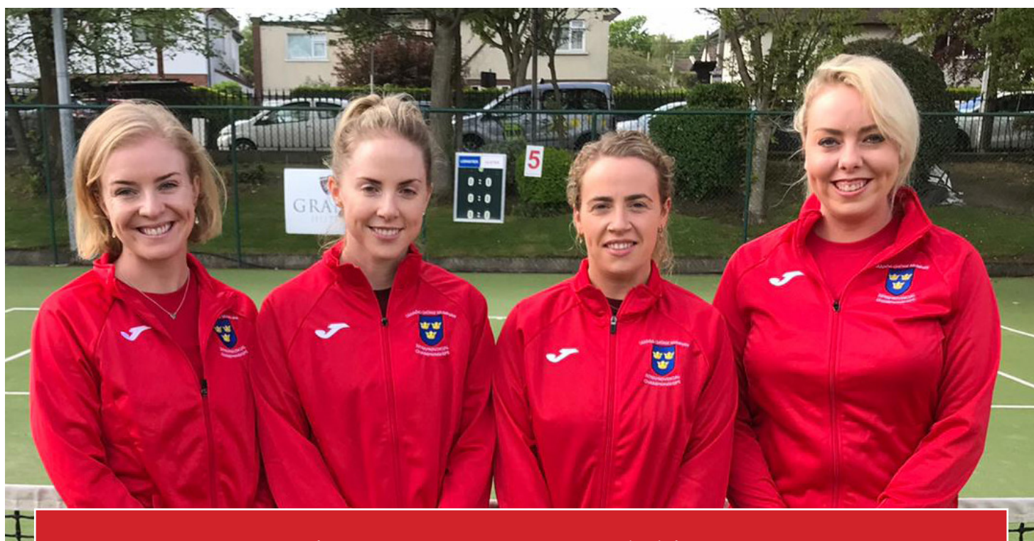
The Womens Over 30s Interprovincial Team

I would also like to take the opportunity to congratulate all the players on the Munster Tennis Inter-Provincial Teams under 18 who won the Inter-Provincial Championships in 2022 (Tied with Leinster).