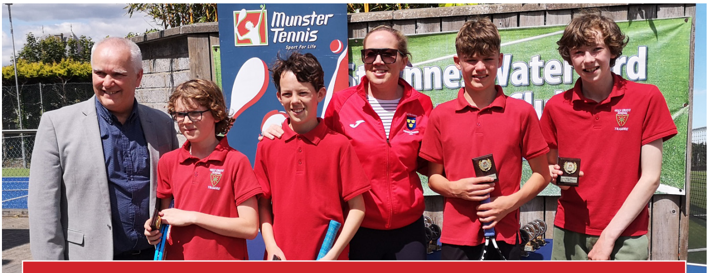
Boys Cup Winners - Holy Cross, Tramore, Co. Waterford

Boys Under19 Shield – St Augustine's, Dungarvan