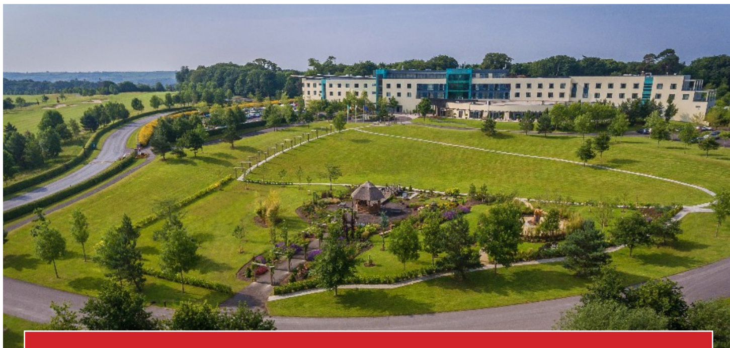
Fota Island Resort continue to be superb partners with us running events at The Tennis Hub.

What has been the result of all these efforts both last year and in previous years? With the latest increases in 2022/2023 this means that the Munster Tennis Winter League continues to be the largest Tennis League in Ireland and also the largest Tennis League in Europe!