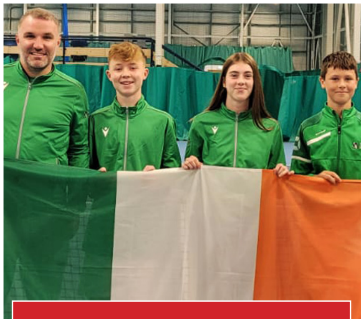
Munster's Junior Four Nations Representatives

Our national camps have continued to run