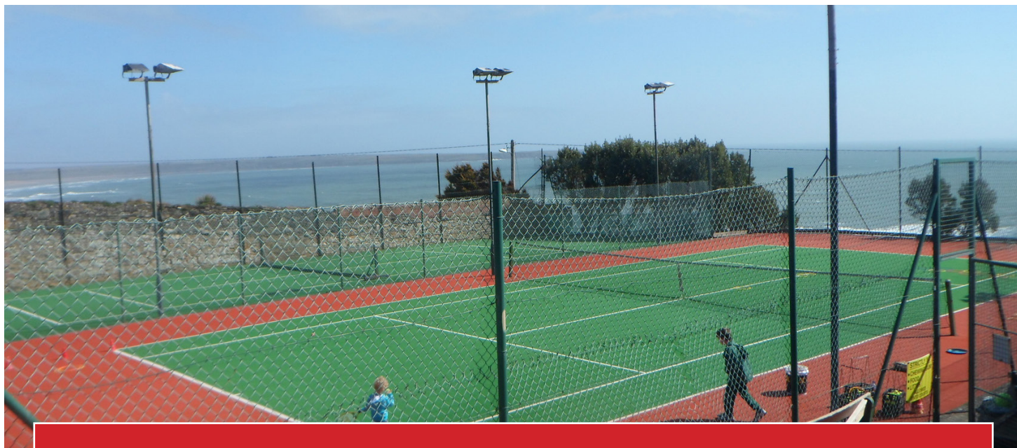
Tramore Tennis Club : Awarded Bronze Clubmark Accreditation

For now, I want to give all clubs a quick reminder that they must have a Safeguarding Statement (template available in appendix 2 of the Tennis Ireland Safeguarding manual) – this is a legal requirement, so is the first thing that a club should have in place. This needs to be reviewed