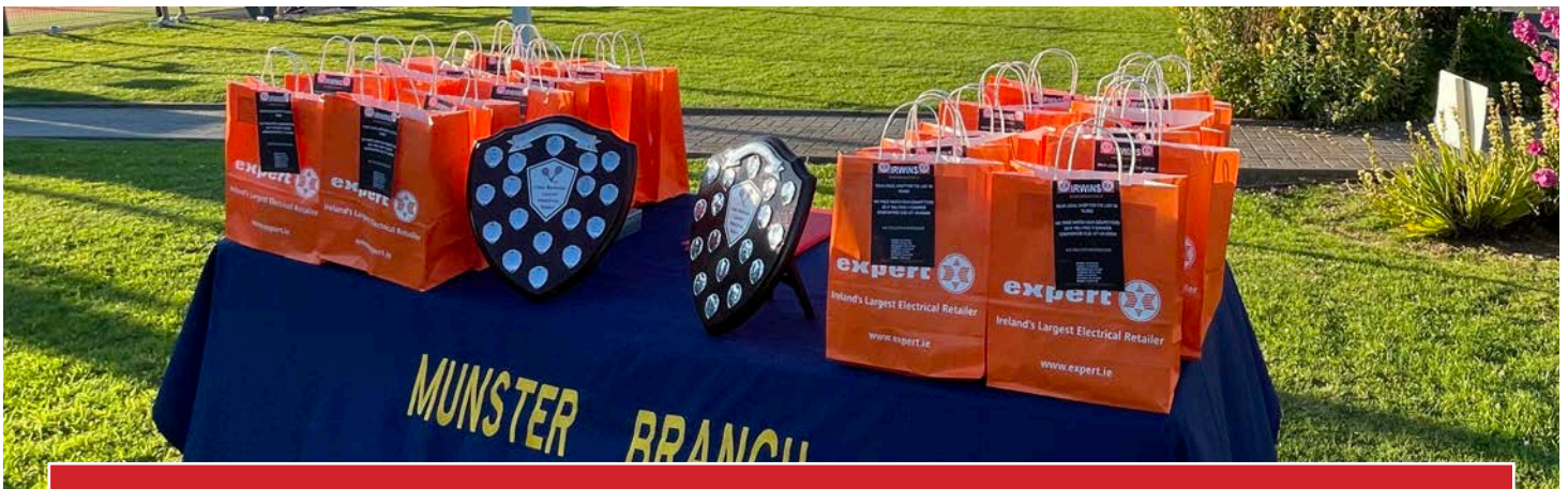
Irwins Megastore were a new partner introduced for 2022 who presented some great prizes!

Munster Tennis have continued to make use of the Tennis Courts at the Resort and several new initiatives will be launched in Summer 2023 in