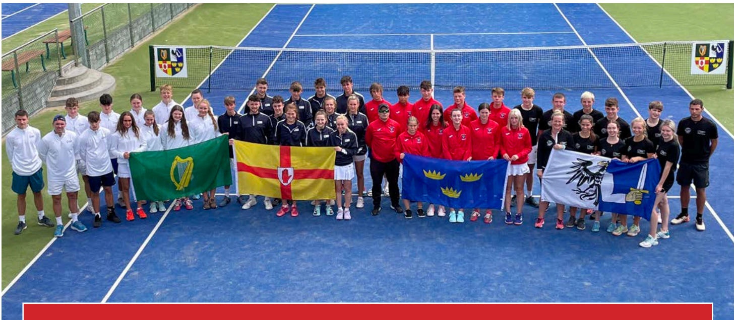
The Under 18s Interprovincial Championships hosted at St. Annes' Waterford Tennis Club

I am sure there is much more that I have left out but I hope that I have given you some indication of what I do for the Branch.