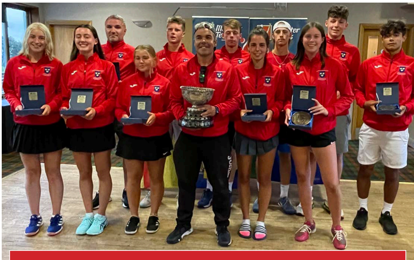
The Under 18 Interprovincial Team Who Tied The Win With Leinster.