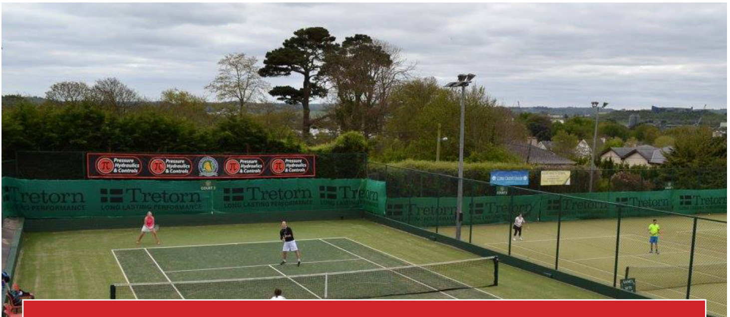
Rushbrooke Lawn Tennis & Croquet Club hosted an international event.