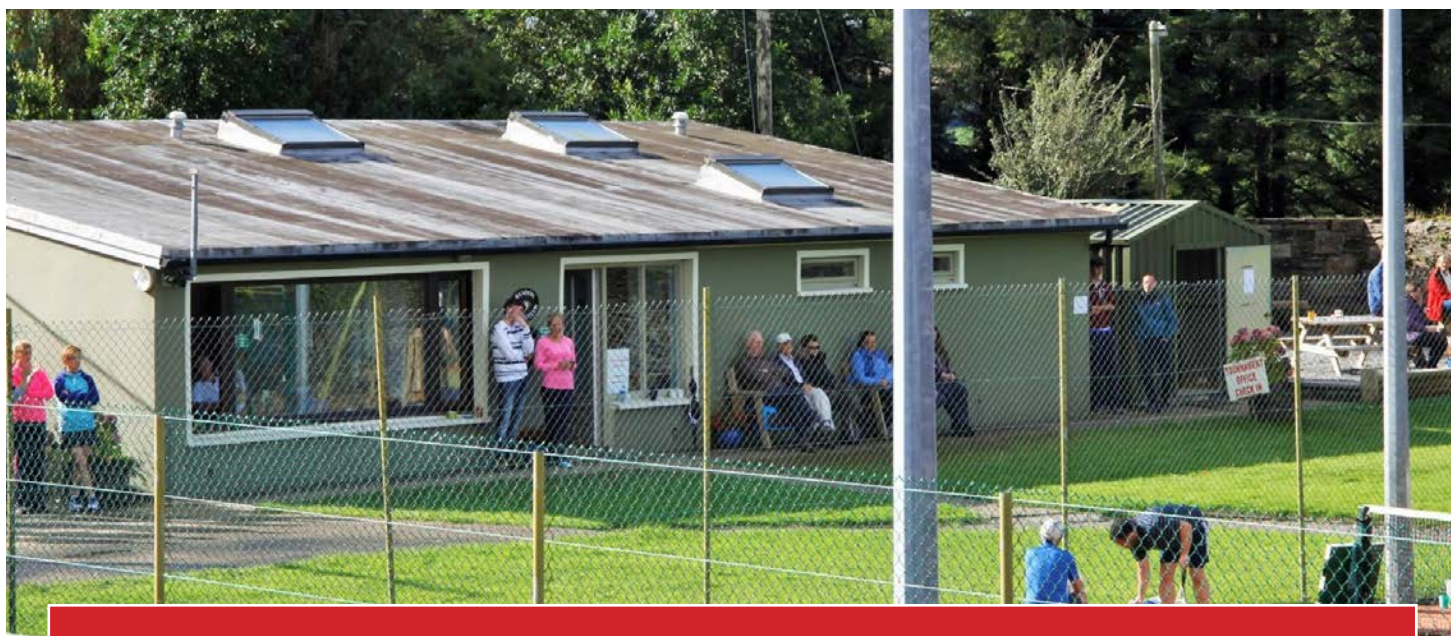
Bandon Tennis Club - Re-Accredited Bronze

We rolled out a pilot of the training in July last year. Having gone through the training as a pilot, we came to the conclusion that it was too in-depth and too long for what clubs wanted, so re-visited it to focus on the more important aspects, and can