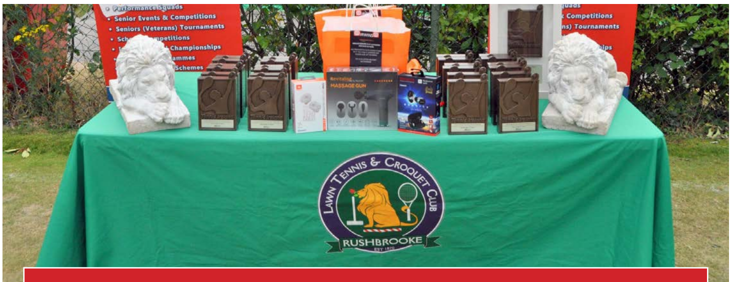
Rushbrooke Lawn Tennis & Croquet Club hosted both of the Seniors Close Championships