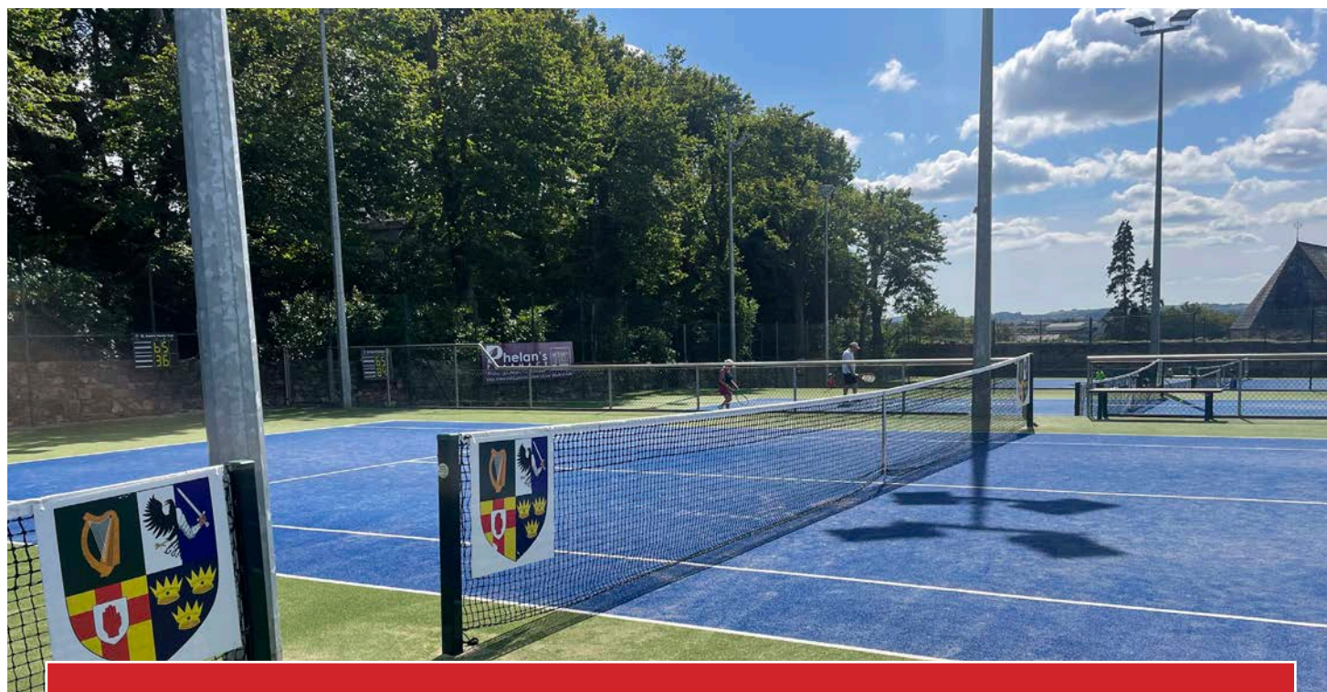
Munster Tennis hosted three national events, including Juniors Interprovincials at St. Anne's.

For many years Munster Tennis has run a regional league in the Cork region. In 2022 we expanded this to the North West region and the South East region. We intend to further expand this in 2023