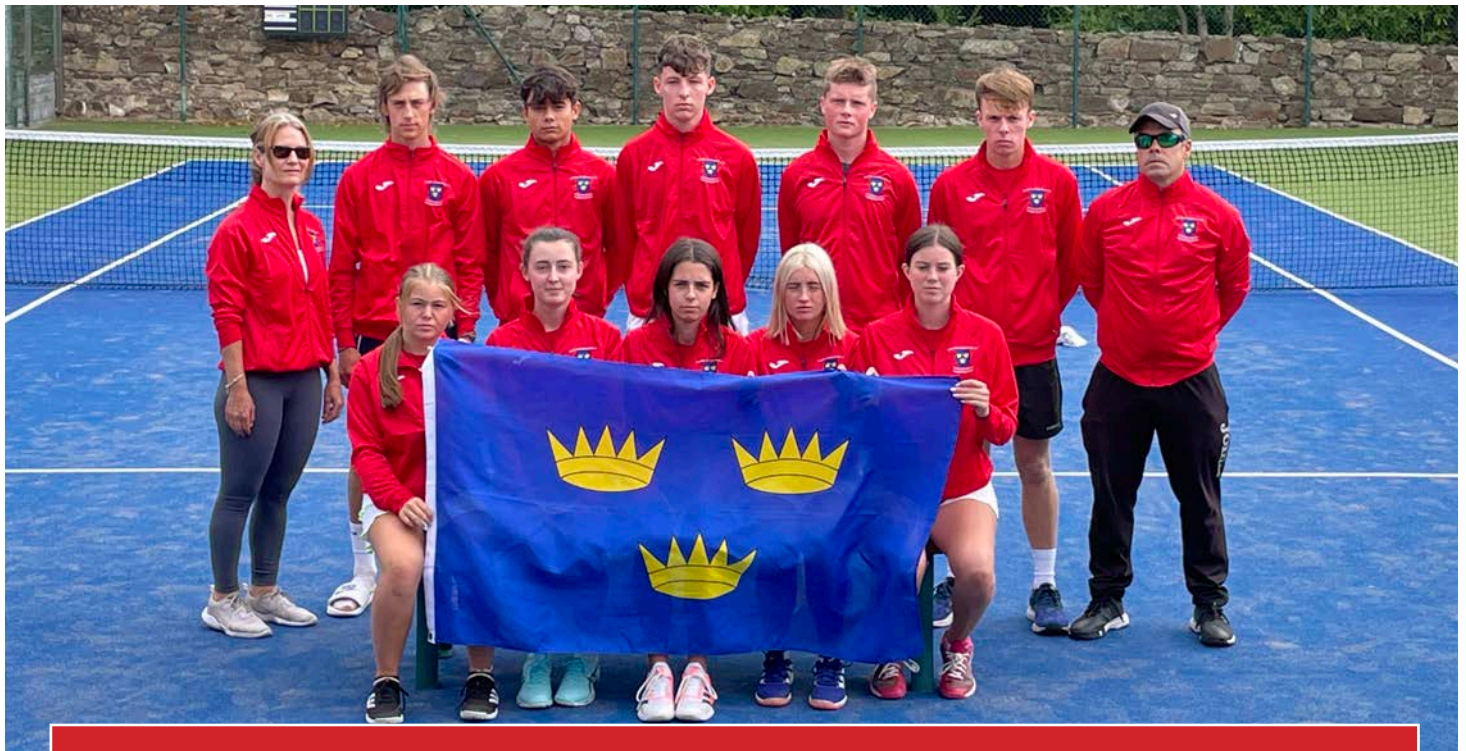
The Under 18s Interprovincial Championship Team