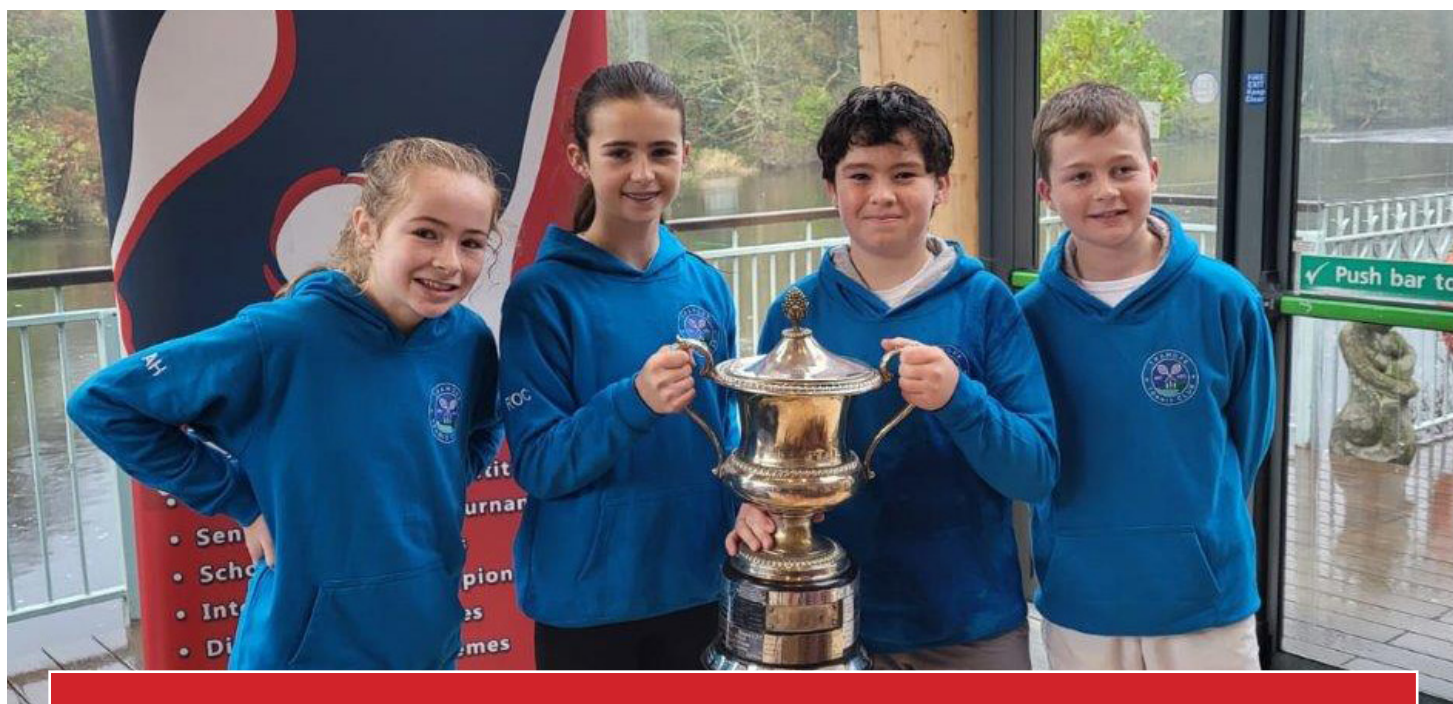
Under 12s Cup Winners - Tramore Tennis Club

The goal will be to increase these playing numbers year on year with further promotion through social media. Instagram has been a big hit with our Junior Members as can be seen from the data with accounts reached, post interactions & particularly impressions.