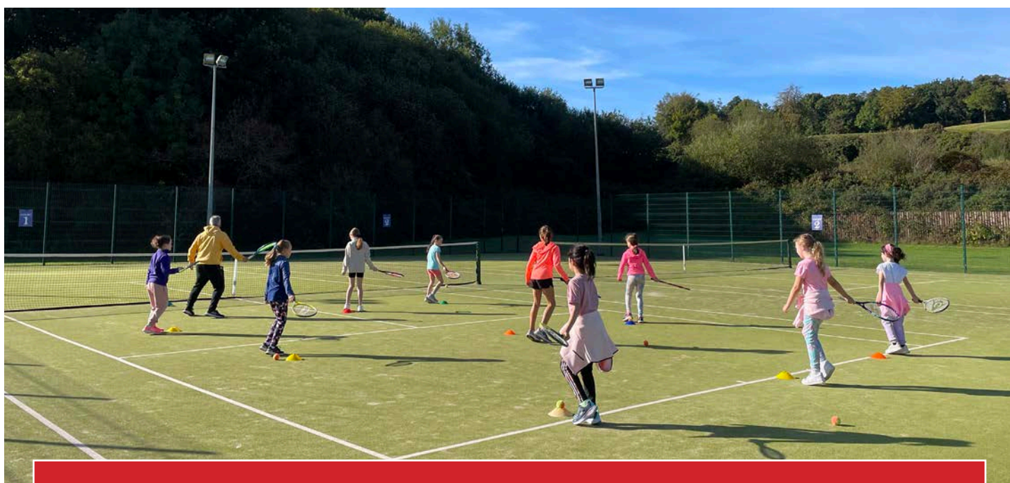
The Munster Tennis Hub at Fota Island Resort is the venue for many events & activities.

To emphasise: The most important consideration is that working together as a team we are