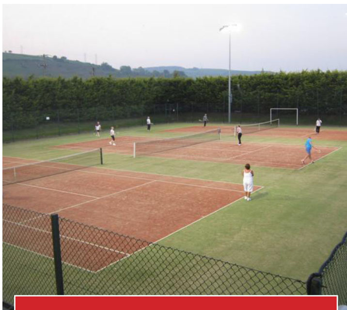
Lakewood Hosted A Level 1 Coaching Course

This grant enabled clubs to apply for up to €5000, to help introduce disability sport into their club,