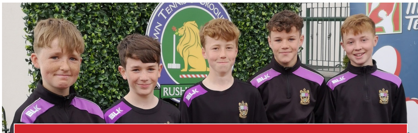
Boys Under14 Cup Winners – Presentation College, Cork