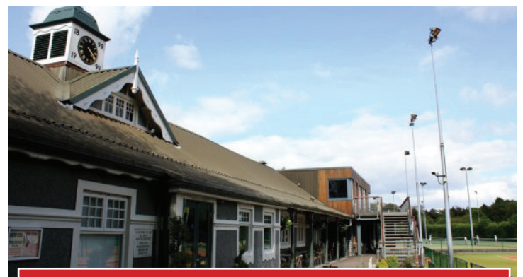
Sunday's Well Kindly Hosted Summer Cup Finals