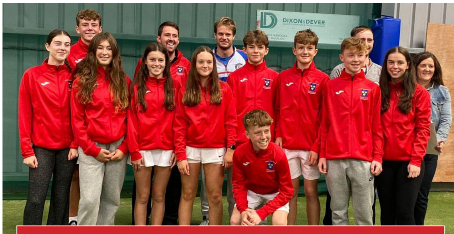
The Under 14s Interprovincial Championship Team

We would like to thank our friends in Connacht Tennis for the wonderful welcome.