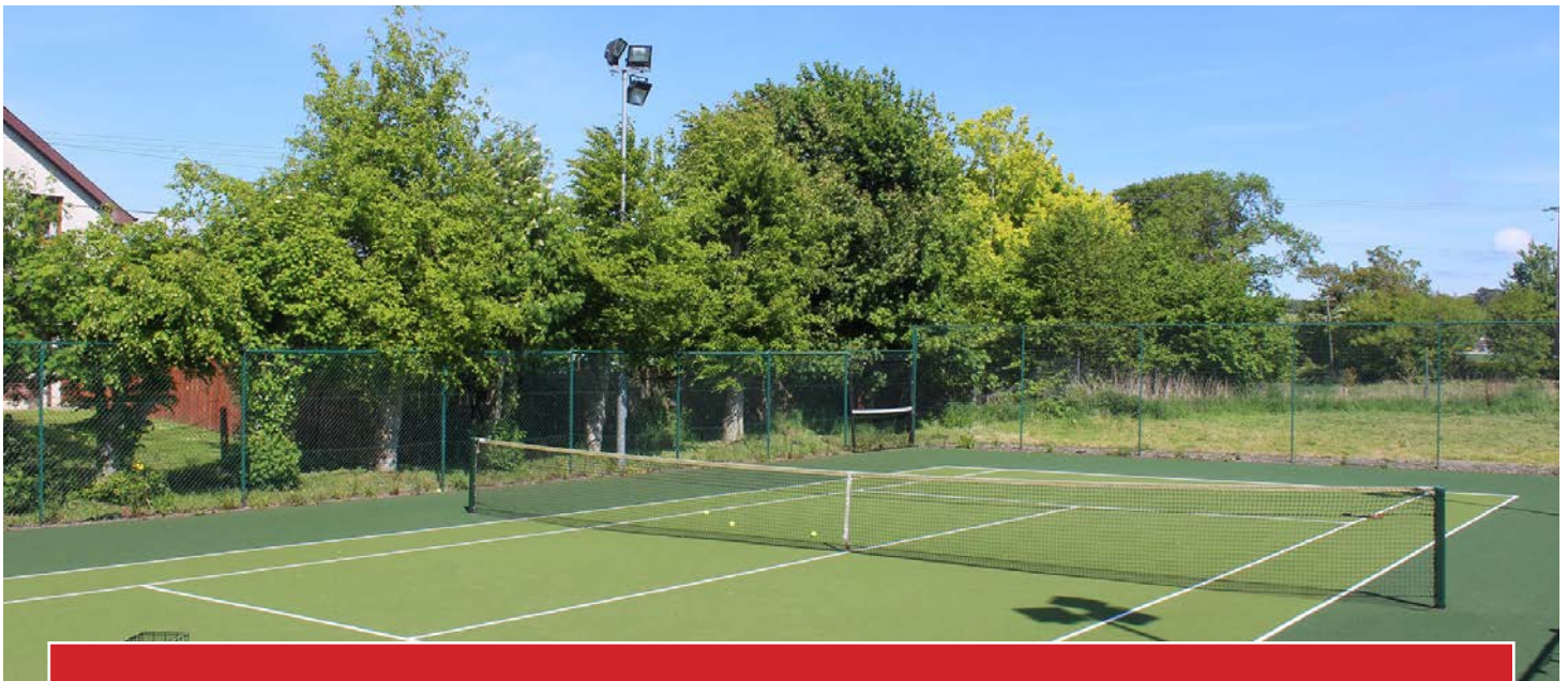
Hazelwood Joined Lombardstown at Mallow Tennis Club for a Group Visit

Off the back of this visit, I arranged a Leaders Course with interested participants from all clubs involved. We had 16 participants from across