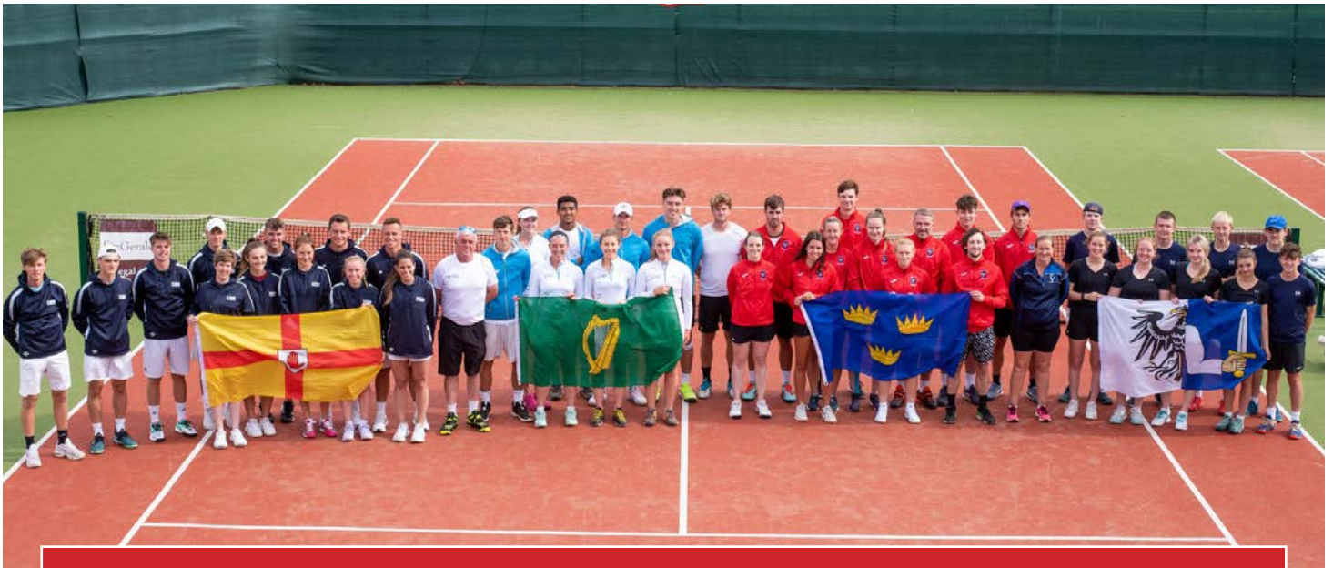
The Senior Interprovincial Championships hosted at Sunday's Well Boating & Tennis Club

Leagues, Junior Leagues and discussions with clubs who are concerned about various club issues, directory queries, tournament queries.