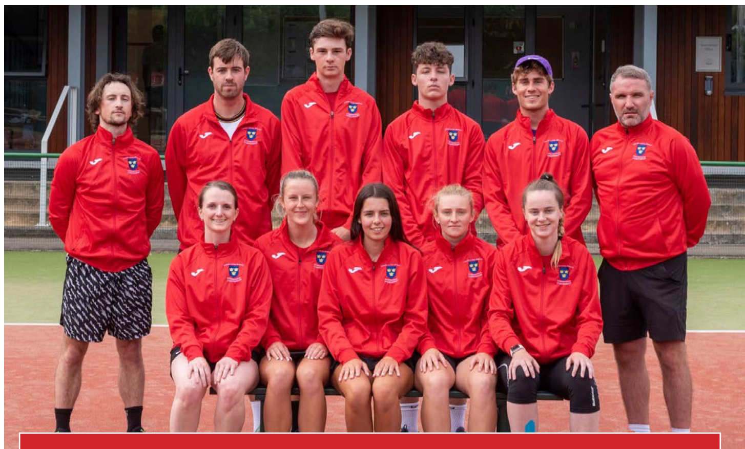
Senior Interprovincial Team at Sunday's Well Boating & Tennis Club